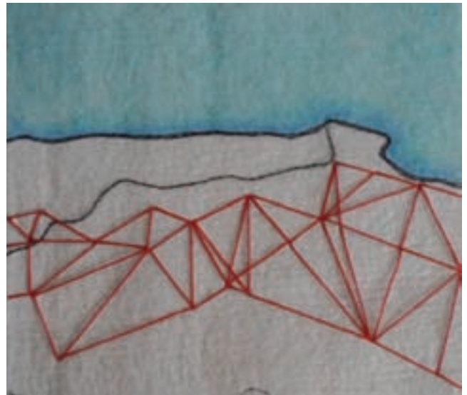
Triangulation, 2010 Color pencil and hand embroidery on industrial felt. 12" H x 12" W Image by Saskia Jordá