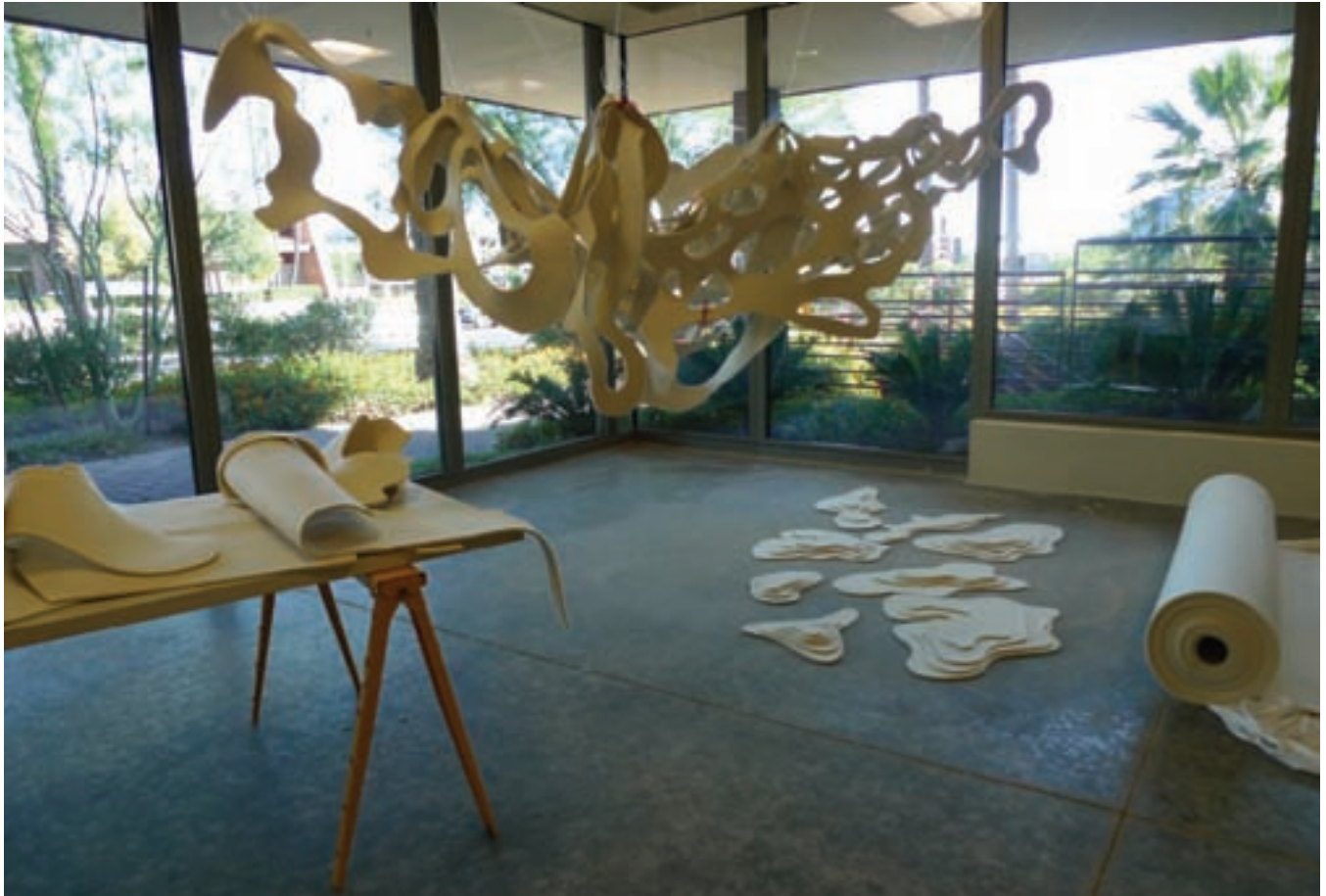
Cartograms of Memory, 2010 Installation in progress, view at Optima Studio, Scottsdale, Arizona. Industrial felt and hand embroidery. Dim. Variable.