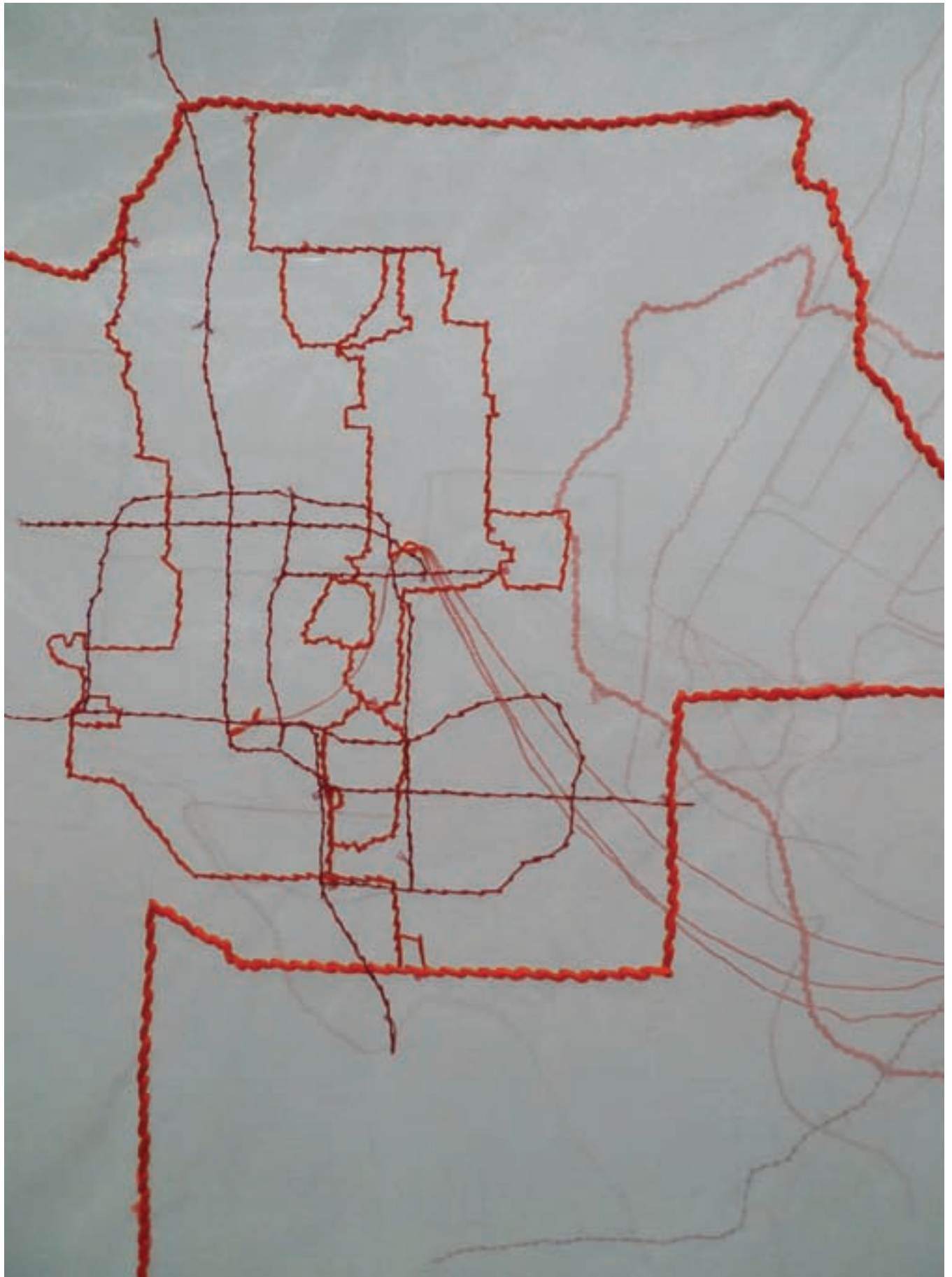
You are Here – Part I: Migration, 2010 Hand embroidery on mesh. Approx. 83" H x 90" W x 50" D Installation at the Phoenix Art Museum, Phoenix, Arizona. Image by Saskia Jordá