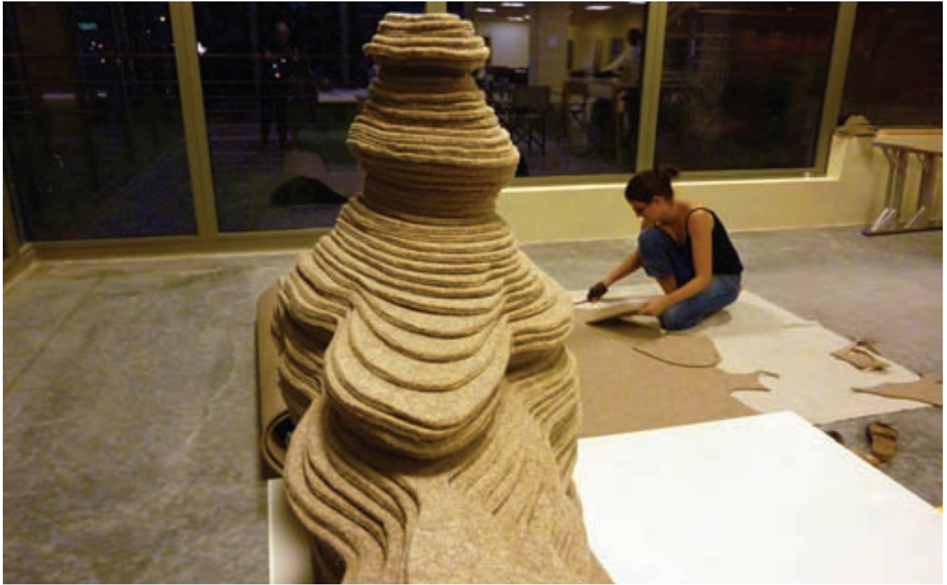
Unbound, 2010 Industrial Eco-felt. Approx. 36" H x 92" W x 31" D. Installation view in progress at Optima studio, Scottsdale, Arizona.