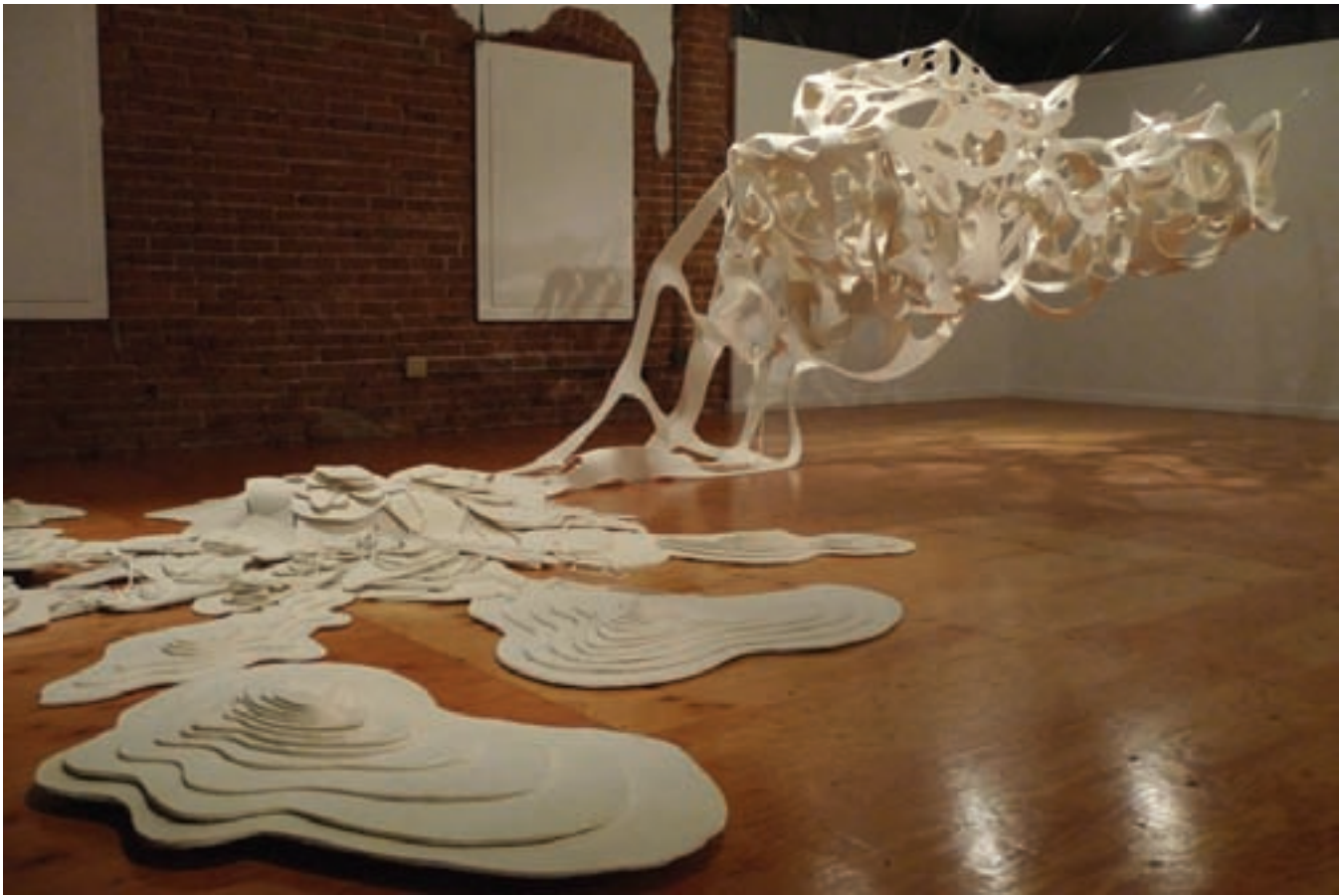
Cartograms of Memory, 2010 Industrial felt and cord. Dimensions Variable. Installation view at Modified Arts, Phoenix, Arizona

“A map is made so we can find our way from one place to another whether in nature or in the mind, not only once, but also again and again.” 1 - Yiannis Christakos