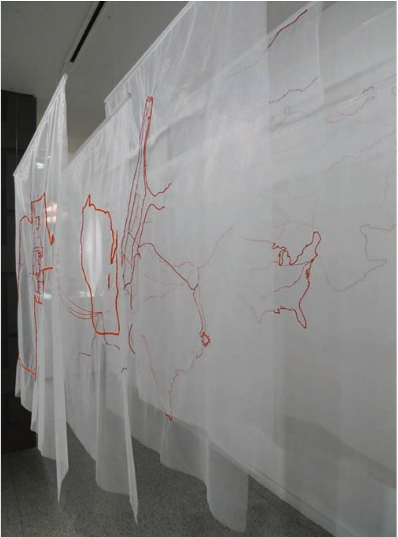
You are Here – Part I: Migration, 2010 Hand embroidery on mesh. Approx. 83" H x 90" W x 50" D Installation at the Phoenix Art Museum, Phoenix, Arizona.