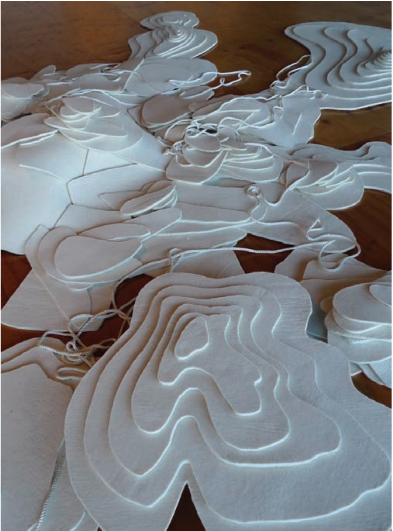
Cartograms of Memory, 2010 Industrial felt and cord. Dimensions Variable. Installation view at Modified Arts, Phoenix, Arizona