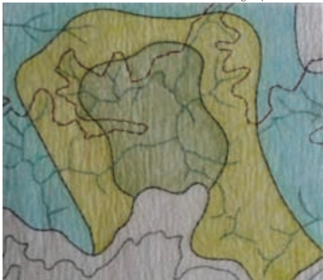
Zona Intertropical, 2010 Color pencil and hand embroidery on industrial felt. 12" H x 12" W Image by Saskia Jordá