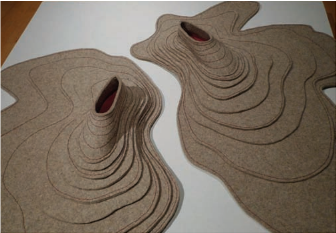
Bound – Size 7, 2010 (Detail) Eco-felt and hand embroidery. Image by Saskia Jordá

of new ‘placement.’ Large forms are cut out of felt, then pieced together by sewing. A portion of this installation forms a suspended mesh of abstracted maps, representing ‘displacement,’ while the opposite end rests grounded on the floor like a topographical map, referencing the sense of ‘placement.’ The two ends are connected by a mid-section that acts as a transition, the space between chaos and order, emotion and rationality, displacement and placement.