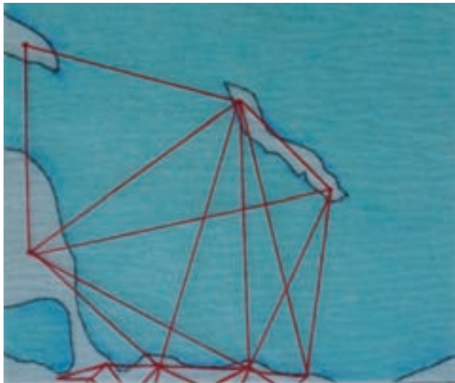
Mar Caribe, 2010 Color pencil and hand embroidery on industrial felt. 12" H x 12" W Image by Saskia Jordá