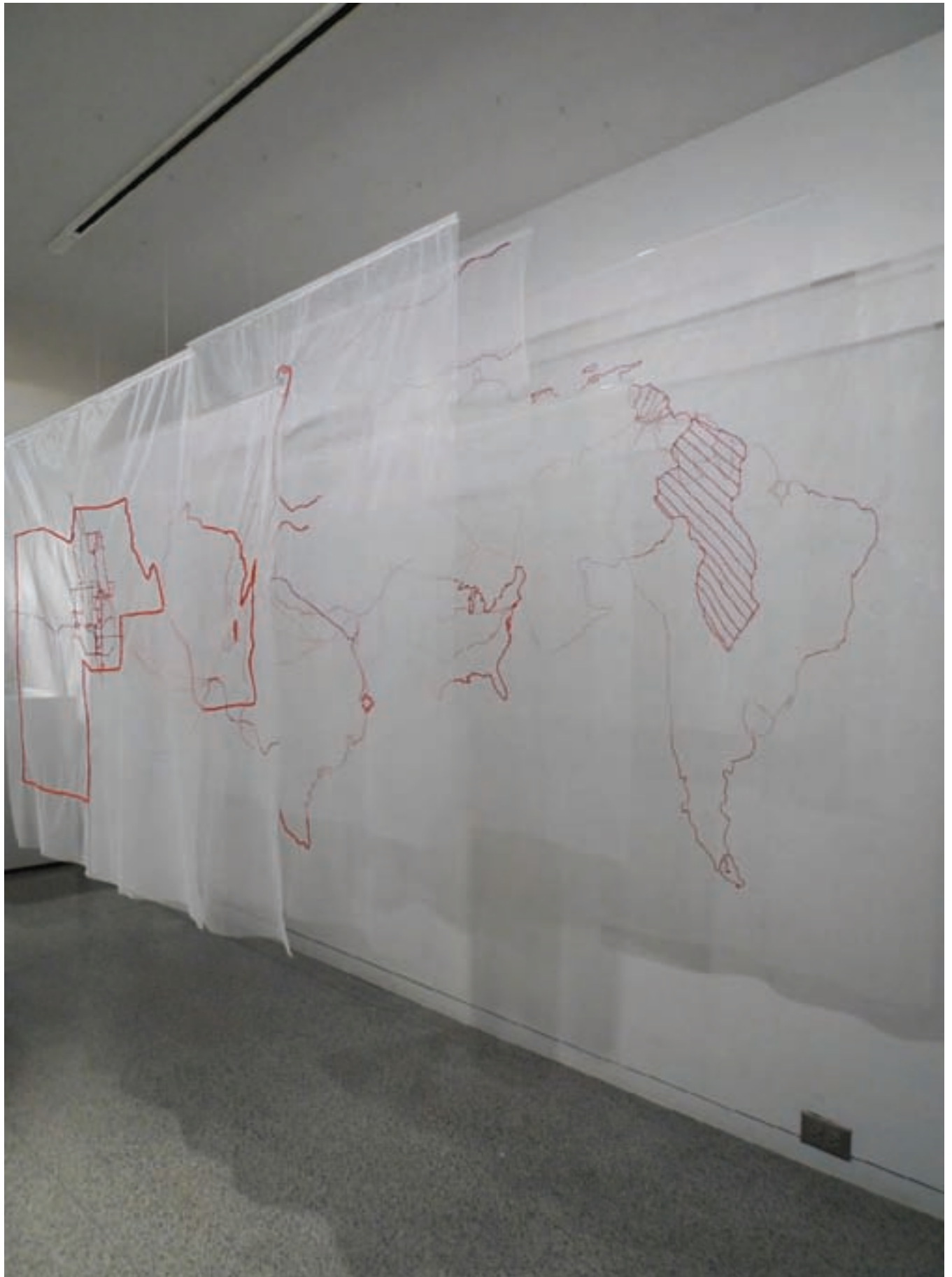
You are Here – Part I: Migration, 2010 Hand embroidery on mesh. Approx. 83" H x 90" W x 50" D Installation at the Phoenix Art Museum, Phoenix, Arizona.